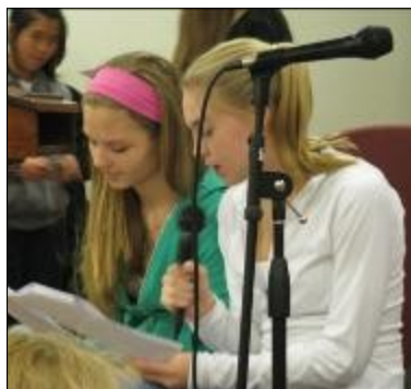
“Santa Claus Is Comin’ To Town,” performed by our youth