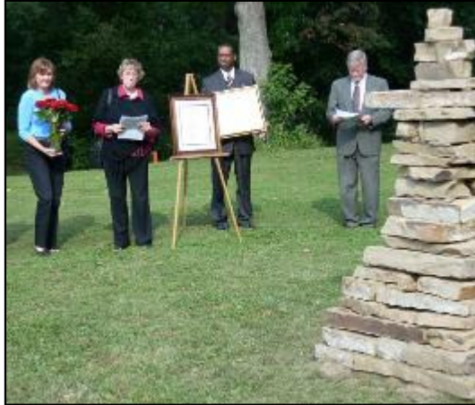
A ceremony commemorating the 17 daughter churches founded by Second Baptist. A rose to represent each church was inserted in the stone cross, which will be moved to the rose garden.