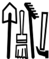
Youth Mission Project

Second's book group will meet Monday, June 9, at 2:00 in the Community Room. The book to be discussed, Quartet in Autumn by Barbara Pym, is a small masterpiece, beautifully composed. It was short-listed for the Booker Prize in 1977.